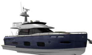
Magellano 50

(1) 2+2 (600g/m 2 ) glass fiber, polyester resin, hand lay up (2) 2+2 (600g/m 2 ) glass fiber, epoxy resin, infusion